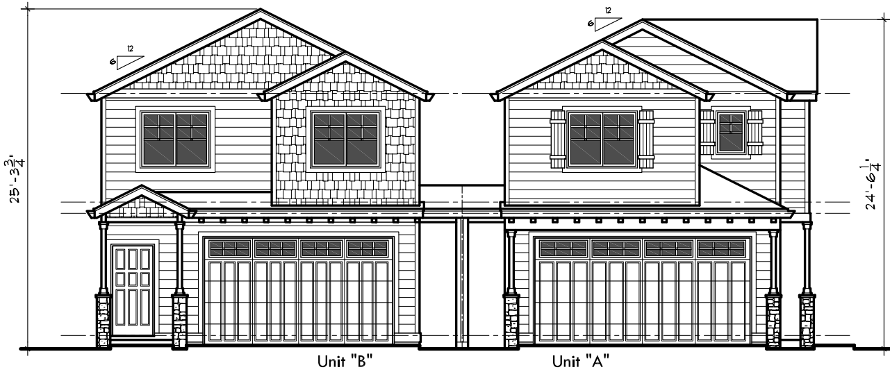
Unit "B" Unit "A"