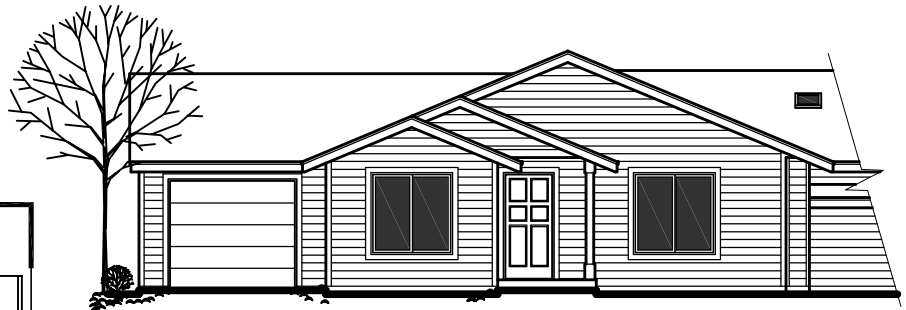
FRONT OF UNIT # 1